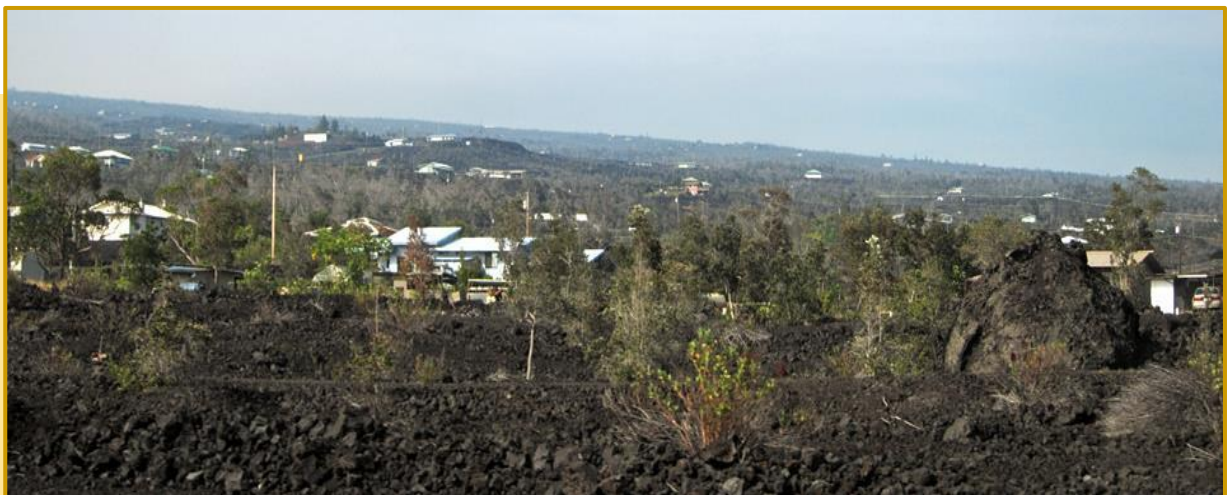
Hawaiian Ocean View Estates

Community Action 17: Grow existing Neighborhood Watch and CERT teams, and develop new ones.